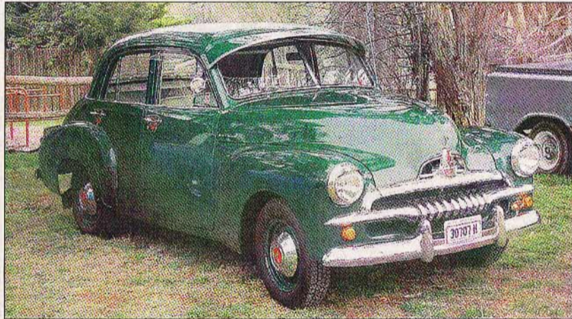
• SHOWROOM CONDITION: A member's pristine FJ Holden during an outing to Taralga on July 20.