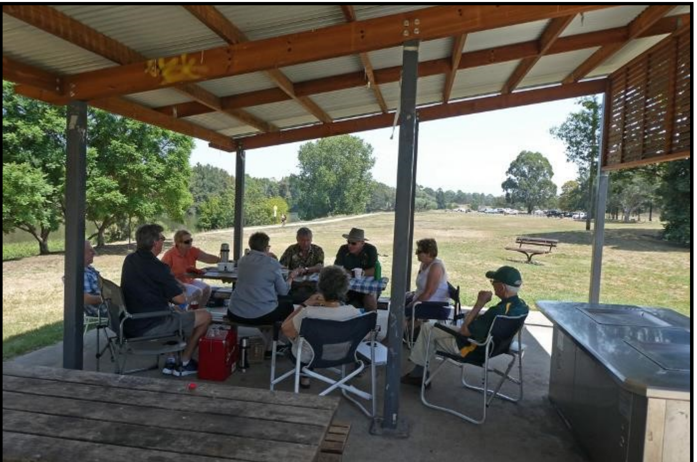
The final meeting place