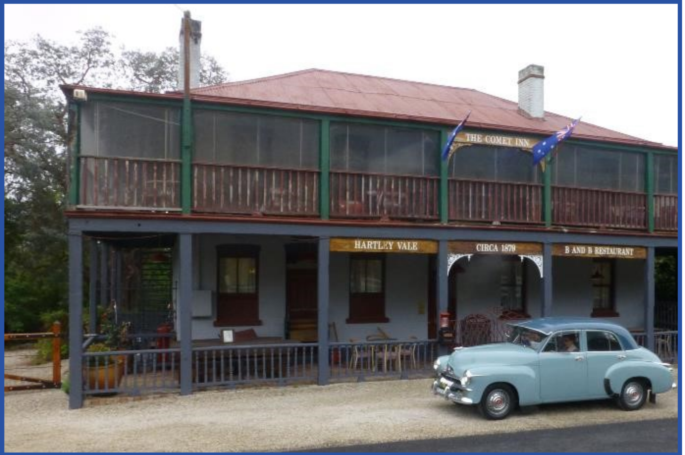
Our club outing in 2017 to Hartley Vale & the Megalong Valley