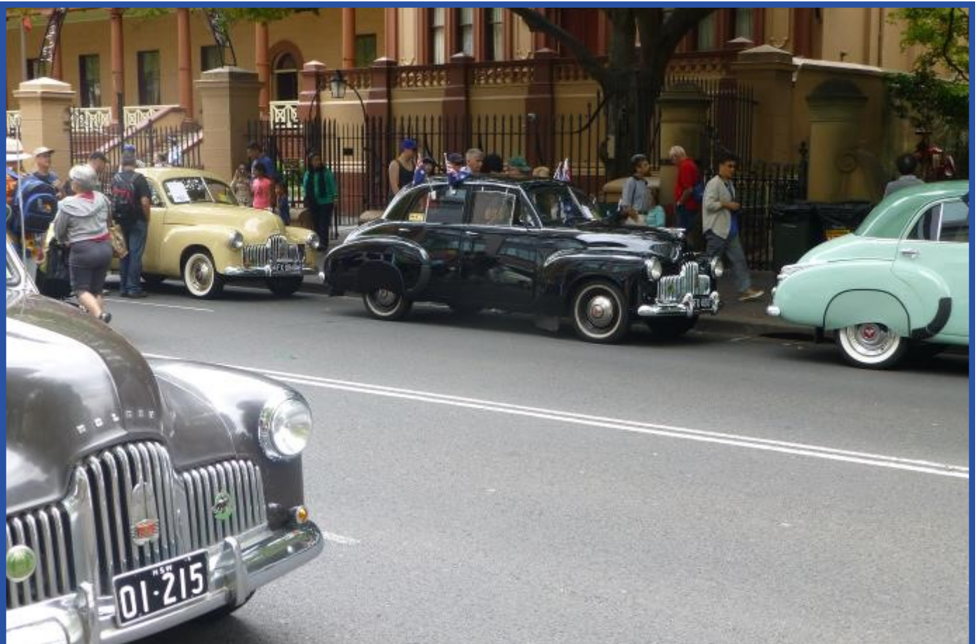
Club cars on display on Australia Day 2014