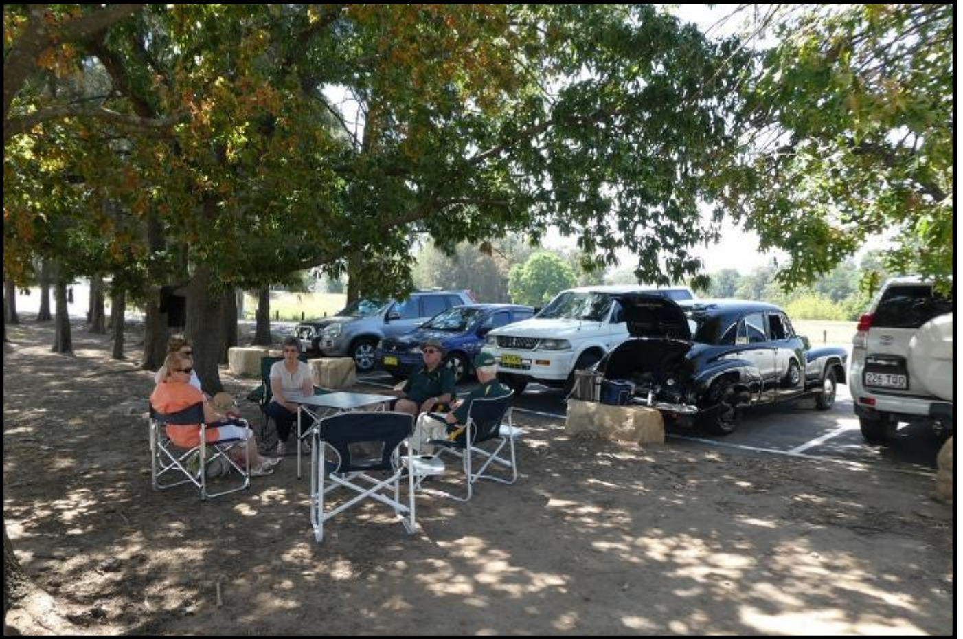
The alternate meeting place