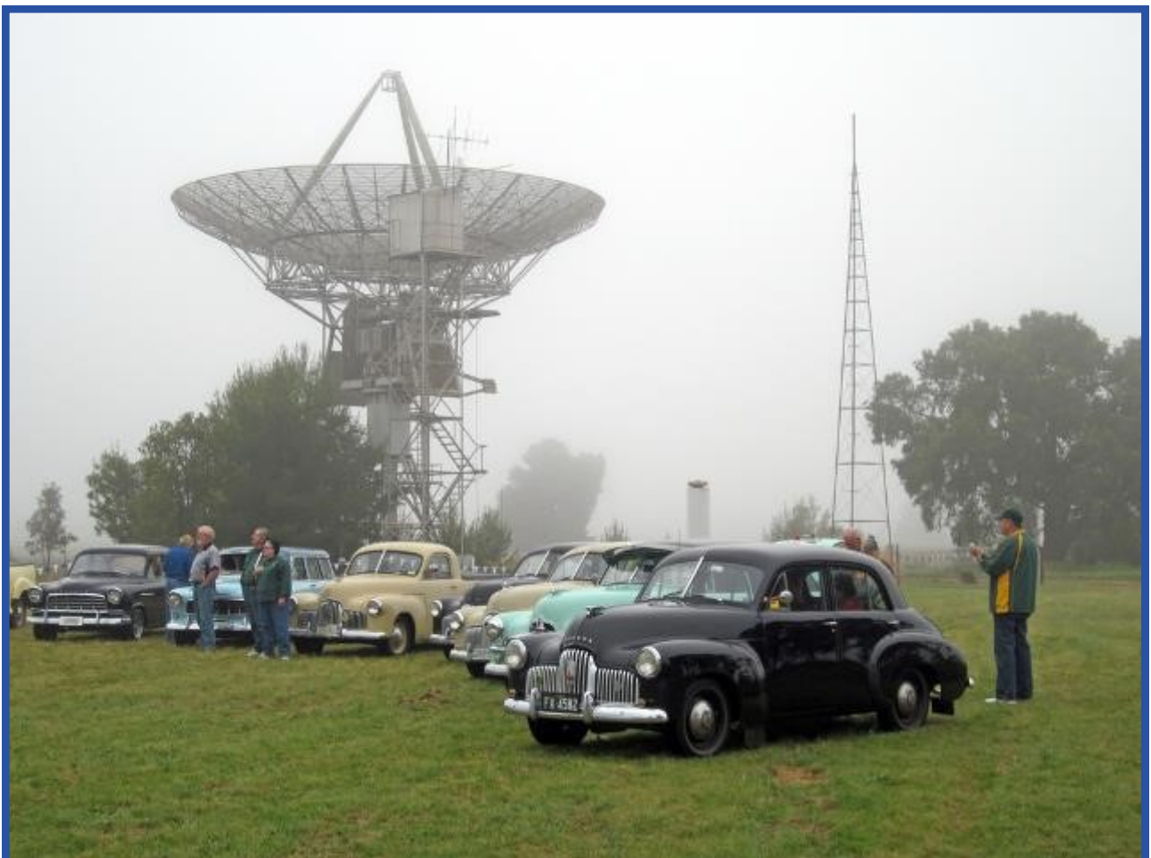
Parkes Radio Telescope visit October 2011