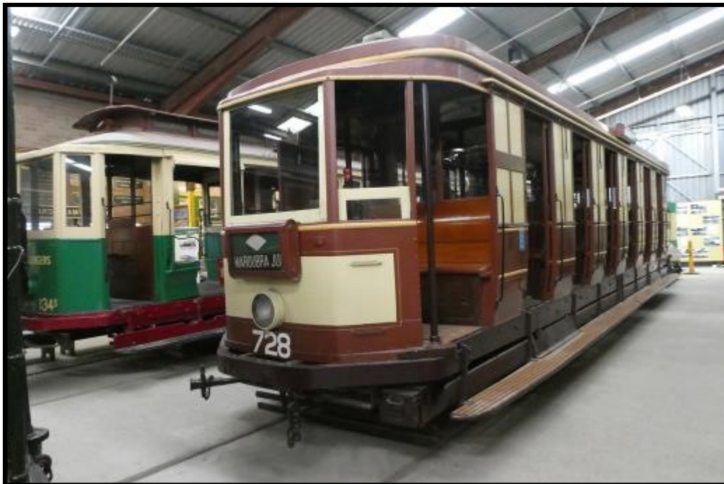
N728 built 1906 by Meadowbank Manufacturing Company