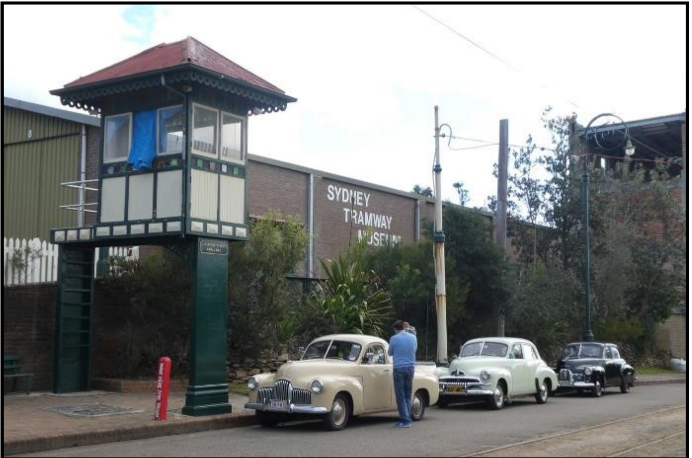
The Liverpool St signal box overlooking our club cars