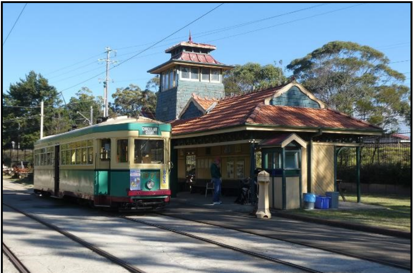
Tram R1-1979 alongside the Railway Square signal box & Geoff Smith