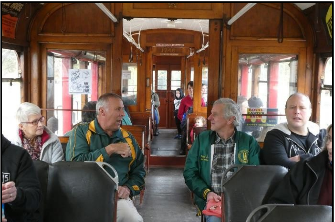
On board tram R-1740, built 1933 by Clyde Engineering