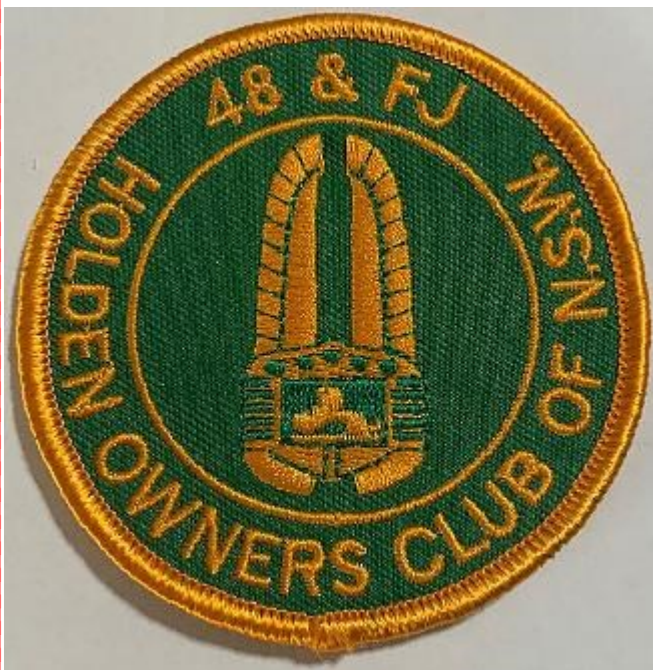
Club Logo Cloth Badge $6.00 each