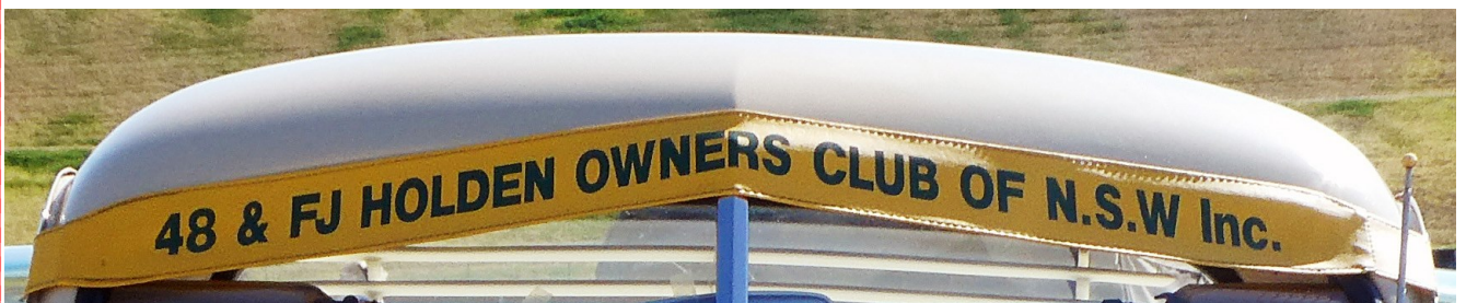
Club Vinyl Windscreen Banner $25.00 each