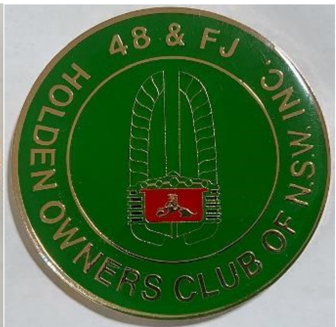
Club Grill Badge $25.00 each