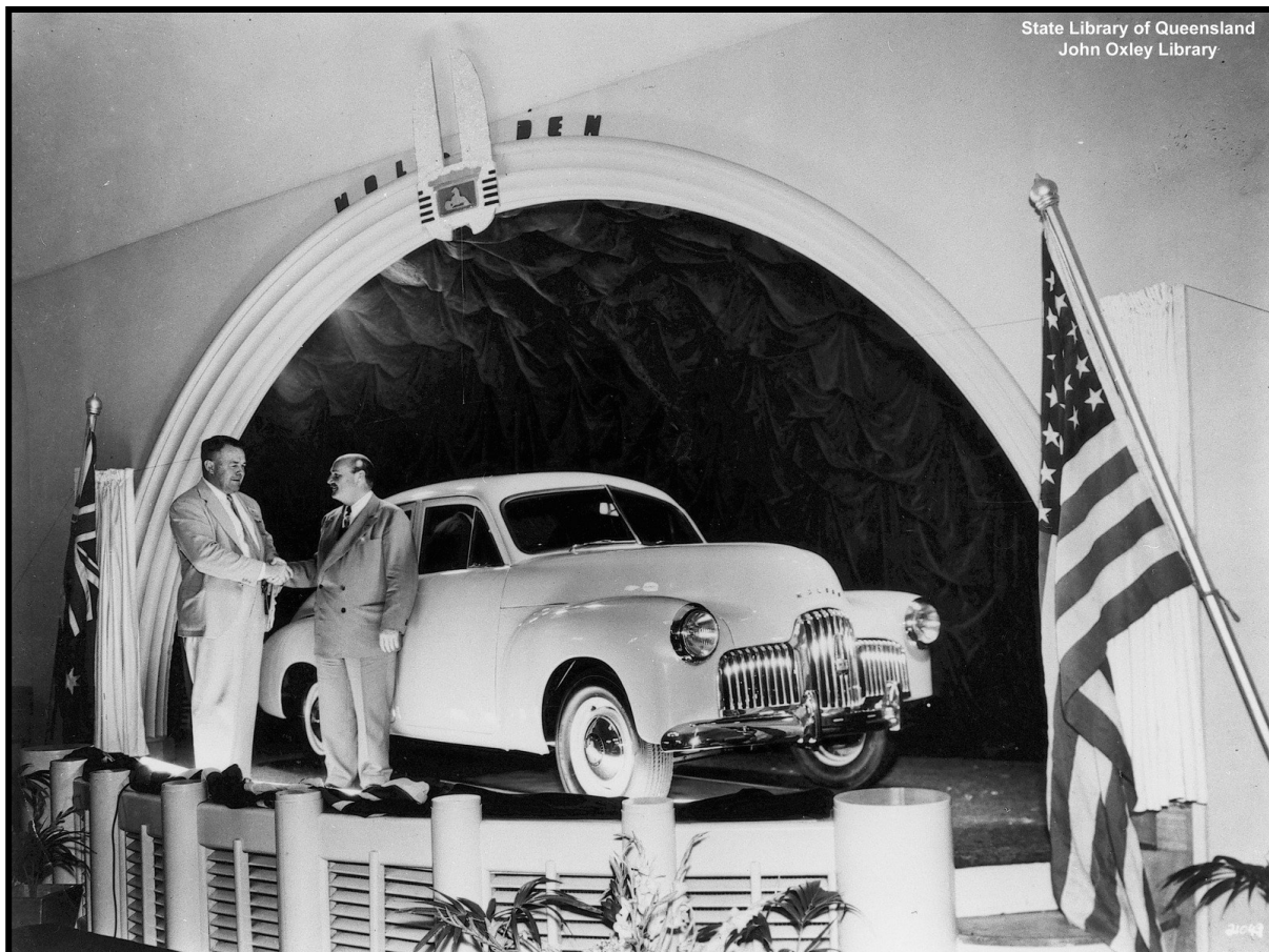
Queensland launch of the Holden 48/215 at Eagers Motors, Brisbane, 1948