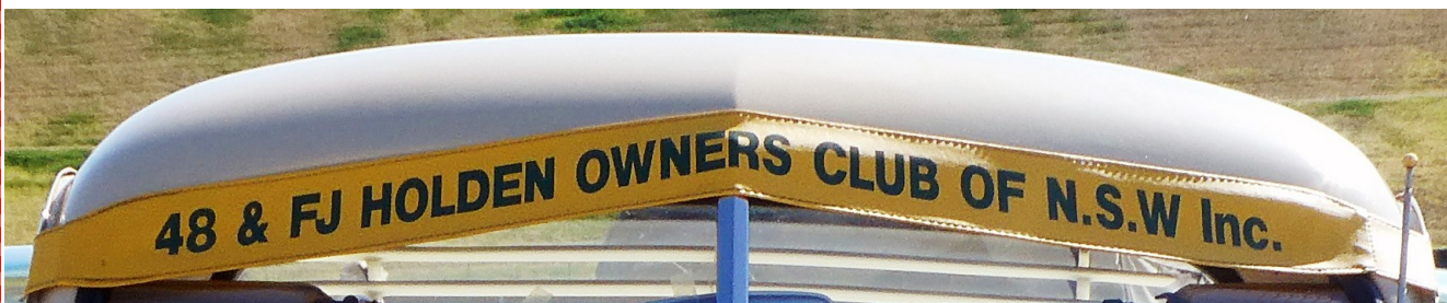
Club Vinyl Windscreen Banner $25.00 each