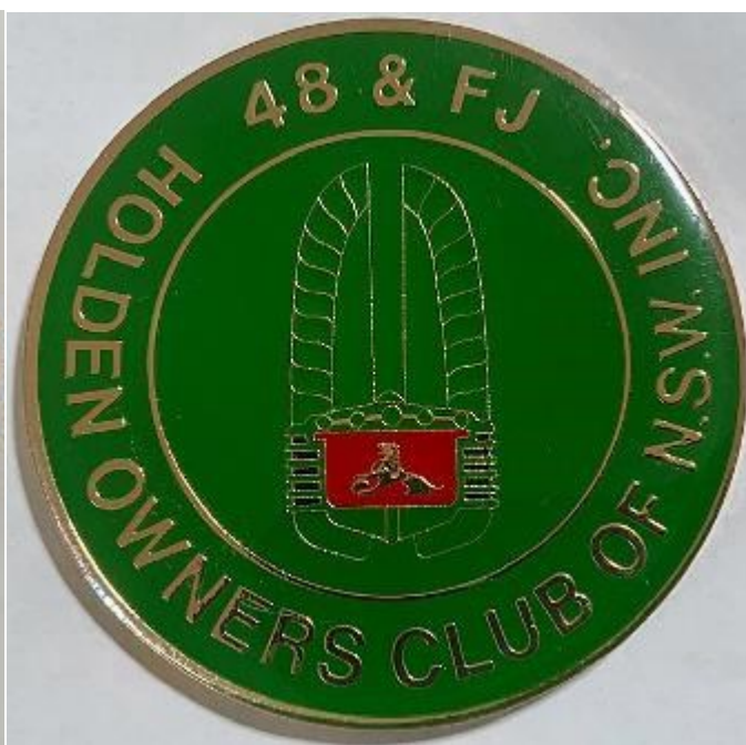
Club Grill Badge $25.00 each