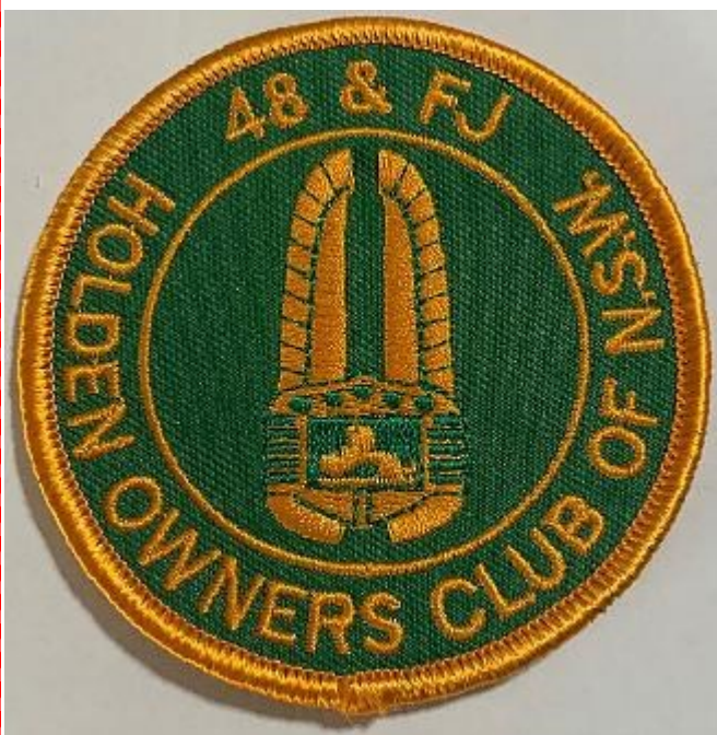
Club Logo Cloth Badge $6.00 each