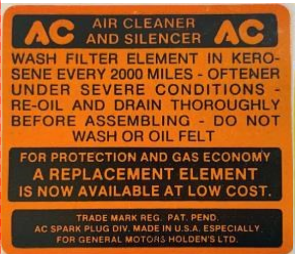
48-215 Air Cleaner Decal $2.00 each

Email orders to mail@48fj.org.au or contact a committee member