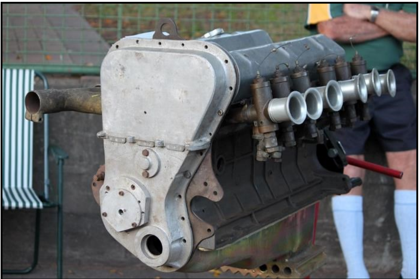
The Fred Foster DOHC grey motor conversion with 6 motorcycle carbies

Peter Hesse closed the General Meeting at 8.50pm.