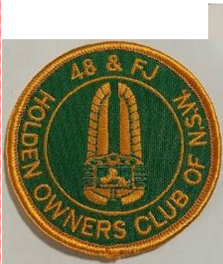
Club Logo Cloth Badge $6.00 each