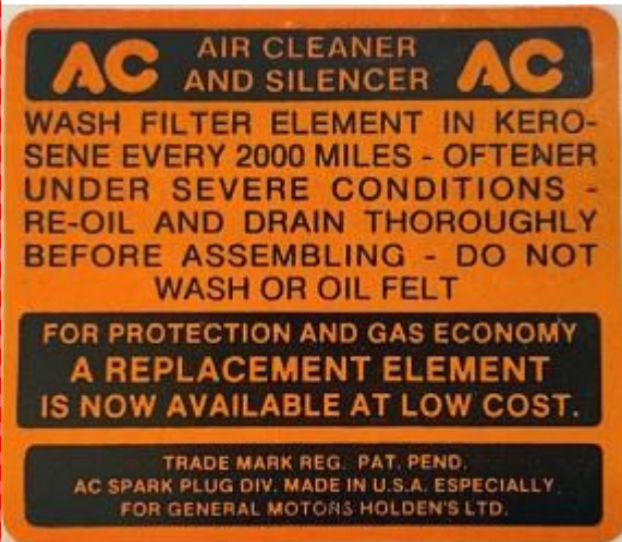
48-215 Air Cleaner Decal $2.00 each

Email orders to mail@48fj.org.au or contact a committee member