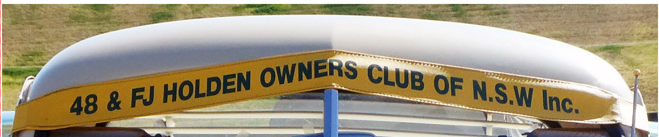
Club Vinyl Windscreen Banner $25.00 each