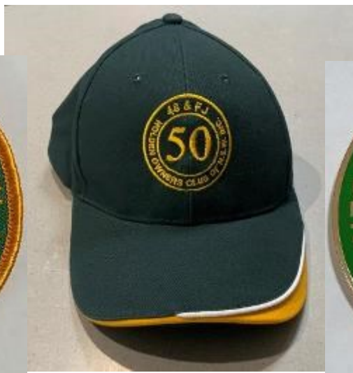
Club cap - $25