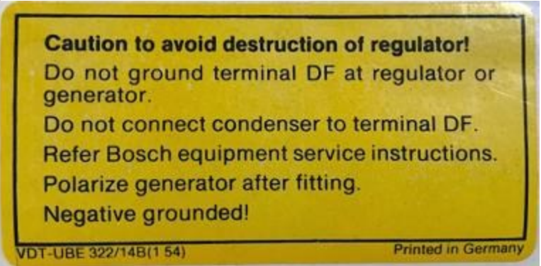
FJ Regulator Decal $2.00 each