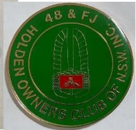
Club Grill Badge $25.00 each