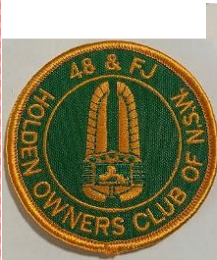
Club Logo Cloth Badge $6.00 each